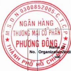
Appendix 2 List of Transactions between the Bank and Related Parties of the Bank; or between the Bank and Major Shareholders, Insiders, and Persons Related to Insiders (Attached to the Corporate Governance Report for the First Six Months of 2025)